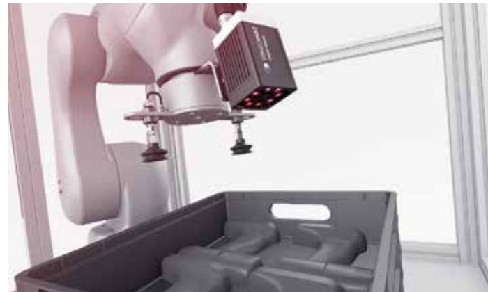
The position of components supplied in a tray can vary so strongly that robot guidance is necessary.