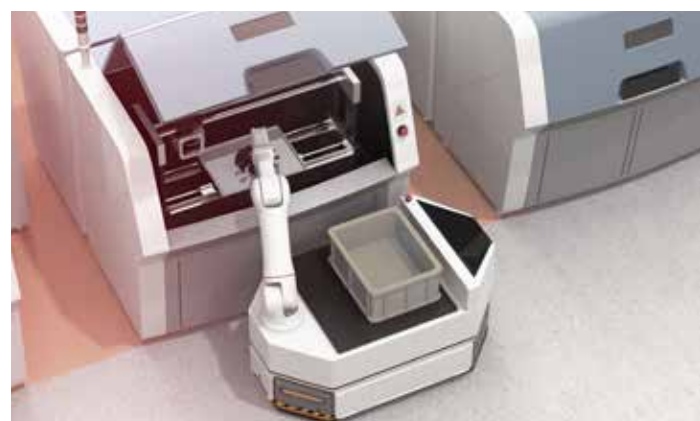
When using mobile workstations, the key is to achieve the ideal ratio between maximum security and the greatest possible freedom of movement for the worker.